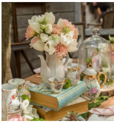
Sunday High Tea enjoyed by many with their Easter Hats.