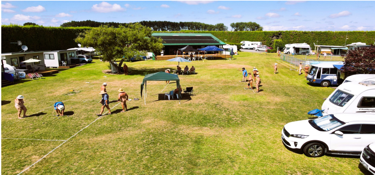
Waikato Outdoor Society: Woodside Naturist Park 50A Trentham Road, Tamahere, Hamilton RD4 3284