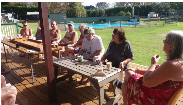
Happy Hour with a little late sun on Easter Friday