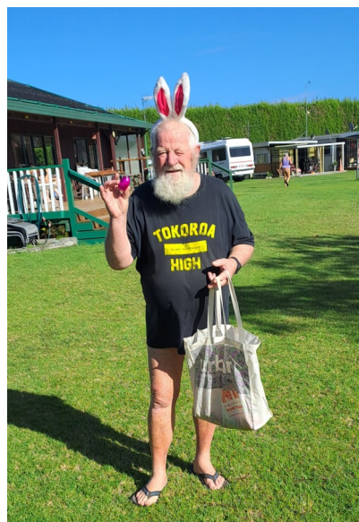
Our illustrious Easter Bunny paid us all a visit and de- livered lots of eggs Thanks Bunny